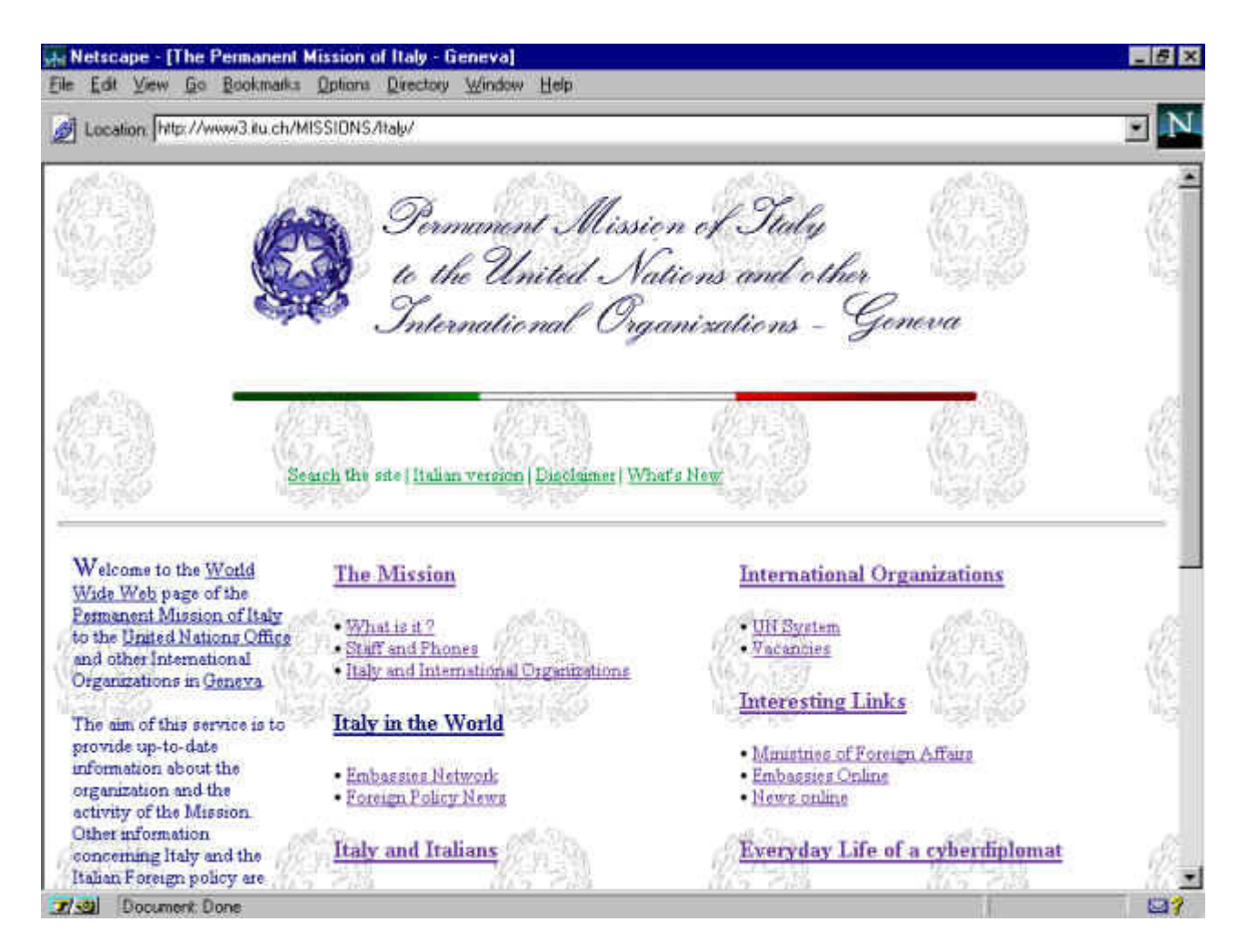
Fig. 5 - Homepage of the Permanent Mission of Italy to International Organisations in Geneva:

The site of the Permanent Mission of Italy to International Organizations in Geneva (<a href="http://www3.itu/MISSIONS/Italy/">http://www3.itu/MISSIONS/Italy/</a>) is a good example of the kind of information given at these sites, with information ranging from details about the relations between Italy and the international organisations in Geneva (WHO, ILO, ECE, CERN, WTO, WMO, Human Rights, etc.), to a list of who's who in the mission, a list of vacancies in international organisations and links to other sites related to international affairs.