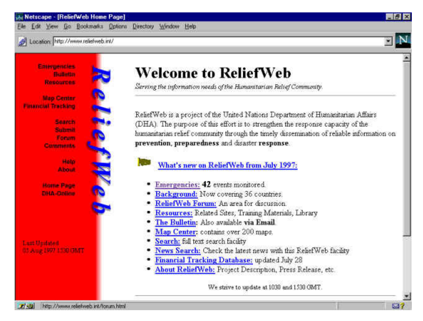
Fig. 3 - Homepage of Reliefweb

Today it often happens that information does not reach the final user, a cause of frustration both for the information source and for the potential beneficiary. Foreign policy information is not an exception and the Internet does offer some unique opportunities to fill the gap existing between the provider and the final user. In fact, Ministries of Foreign Affairs, international organisations, NGOs and others are realising the opportunities available. Many of them already have updated press releases, offering at the same time extensive information on their mandates and activities. The more advanced even send this information through e-mail to subscribers on distribution lists which they have set up for this purpose (for free), thus increasing the probability that at least some the information they produce will reach the interested parties. The Department of Humanitarian Affairs of UN (UN/DHA) is a good example, as it sends Diplomatic Missions updates on emergency situations in different parts of the world via e-mail.