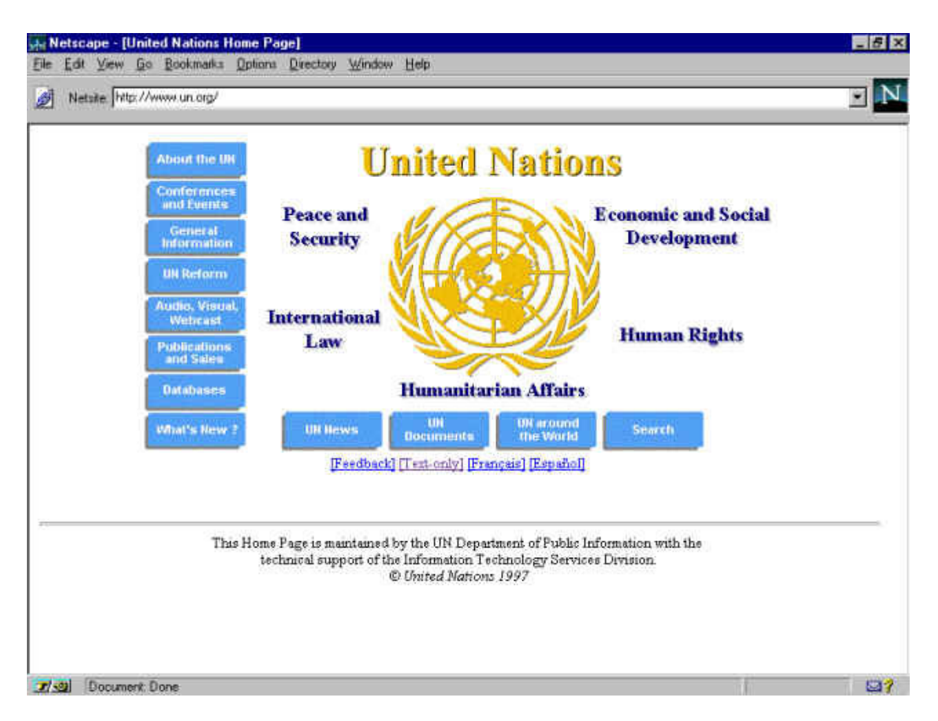
Fig. 2 - United Nations Homepage

Most of the UN bodies have set up a Web site and an official UN Web site locator (<a href="http://www.unsystem.org">http://www.unsystem.org</a>) has been created to facilitate both access and the retrieval of information. The different sites are brief, in order to give an overview of the activities and the nature of the organisation, and they often provide additional updated information, such as press releases, programmes, calendars of meetings, reports, description of co-operation programmes etc., which can be most valuable for the diplomatic community. There are also sites with unofficial lists of international organisations and other organisations (UN and international organisations and related links) dealing with international matters which can assist the diplomat. The most renowned is the page prepared by UNDCP(4) (<a href="http://undcp.or.at/unlinks.html">http://undcp.or.at/unlinks.html</a>) which features links not only to all international organisations, but also more than one hundred related links concerning international matters.