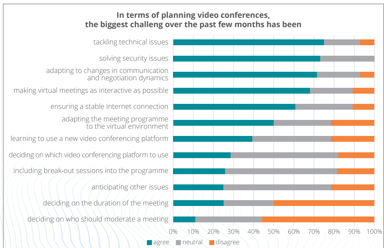
Chart: DiploFoundation survey conducted in September 2020 – experiences of diplomats with planning video conferences

In many cases, diplomats have little choice over which platform to use. Organisations or ministries often determine this. The UNSC for example relies on its existing video conferencing system.