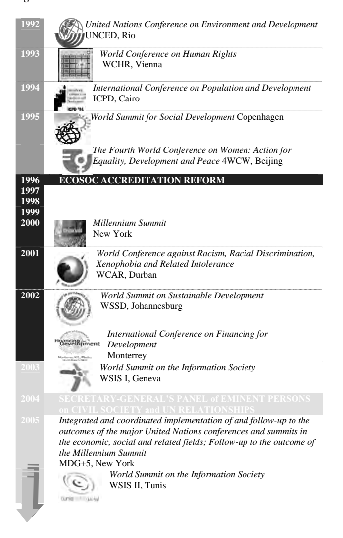
Figure 4 Overview of Selected UN Summits In the 1990s Until Today

Is the Time of Big Conferences Over? What Comes Next?