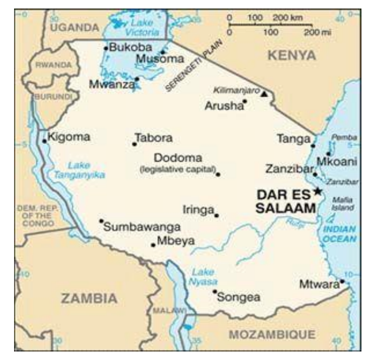
Figure 2: Map of Tanzania (US Department of State, 2011)