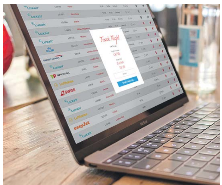
Lux-Airport's website and mobile application feature flights' status and live flight trackers, flight timetable, indoor maps and positioning, real-time personalisation platform and automated marketing.