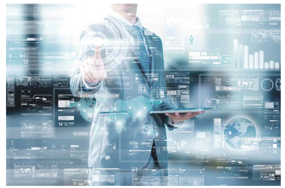
\label{lem:makes} Malta's \ unique \ digital \ growth \ makes \ it \ well-placed \ to \ help \ with \ a \ 'digital \ rEUnion \ for \ Europe'.

This unique digital growth makes Malta well-placed to help with a 'digital rEUnion for Europe'. In particular, it can be done through the EU's Digital Single Market