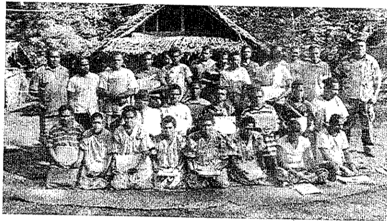
The participants pose for a picture after the training programme

"We will continue to remain solid within our group and will continue to work together to get more training courses in our area to help develop us. We believe that even though many of us have been left out of the normal formal education system we keep our hopes alive, and know that in life there will always be success if we strive to achieve it," Toa said.